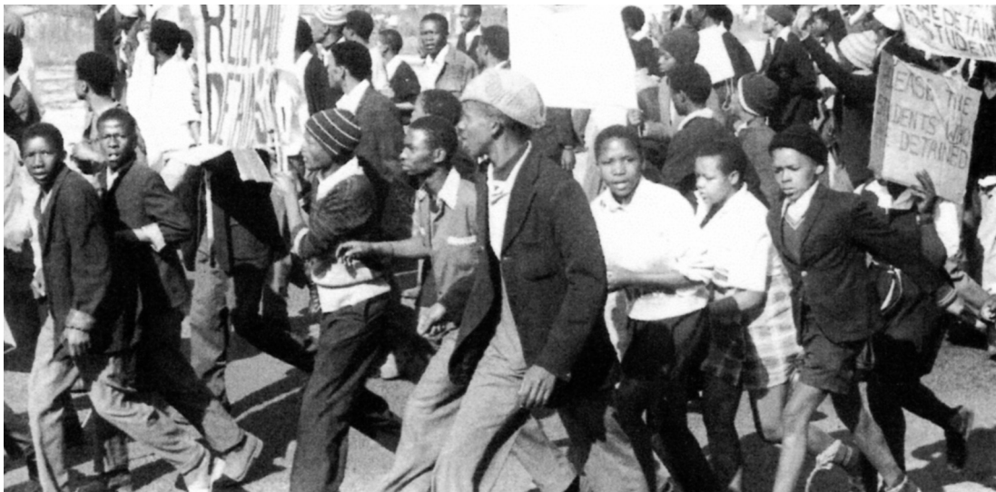
Students in Soweto in 1976.

18 Study the photograph, and then answer the questions which follow.